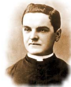
Father Michael J. McGivney Born August 12, 1852 Died August 14, 1890 (age 38) Founder of the Knights of Columbus